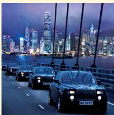
Rolls-Royce Phantom fleet