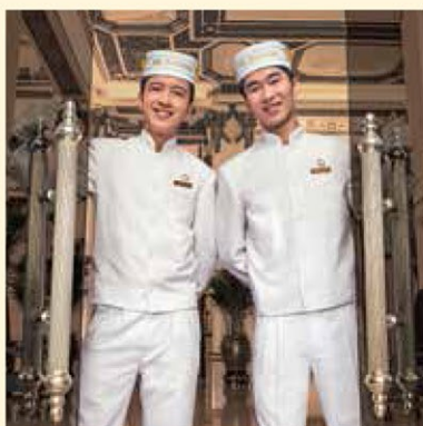
A warm welcome