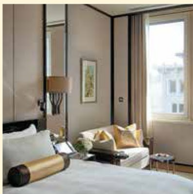
A new era of residential luxury

The Peninsula Hong Kong, which opened in 1928, is consistently ranked as one of the world's top hotels. Ushering in a new era of guest personalisation, newly-enhanced rooms boast a bespoke residential feel with the latest technology and the finest design and craftsmanship.